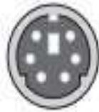
Mini-DIN 6 plug