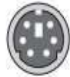
Mini-DIN 6 plug