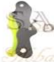
Grip Descender YAE008 (1pc)