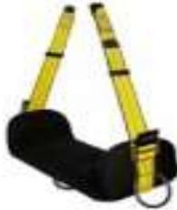
Easy Seat ES-101 (1pc)