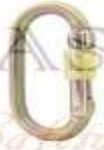
Carabiner (4pcs) Screw | Autolock