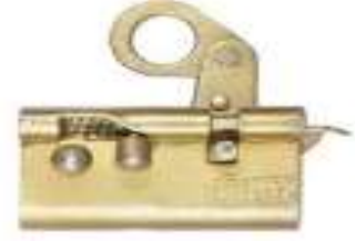
Rope Grab YRG001 (1pc)