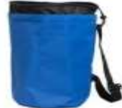
Kit Bag (1pc)