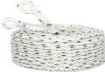
Twisted Rope 14mm 50m | 100m | 150m