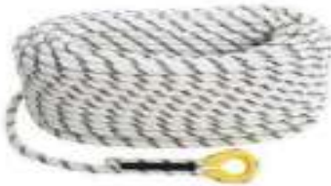
Kernmantle Rope 10.5mm 50m | 100m | 150m